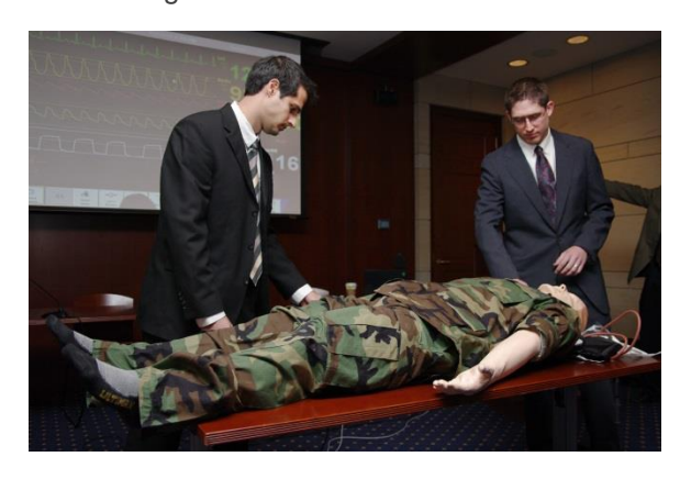
A demonstration of SimMan on Capitol Hill.

patient examinations, and clinically focused mentored learning in hospital and ambulatory care settings.